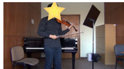
Good Image Examples: