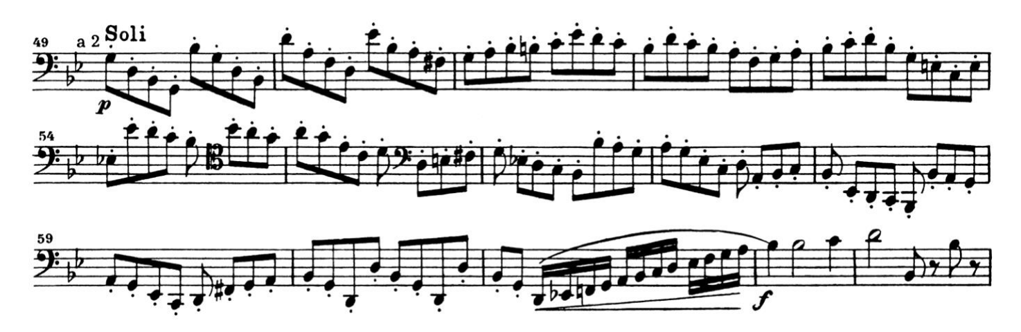
Be Prepared for Sightreading